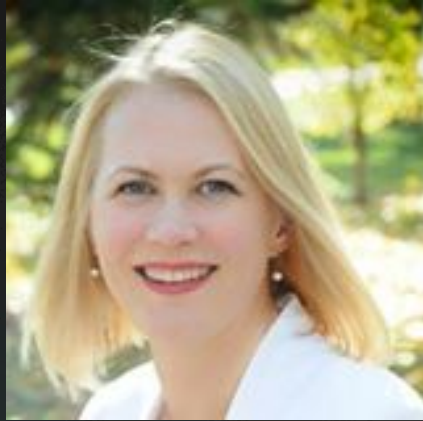
Ave Peetri, PCC OMAN